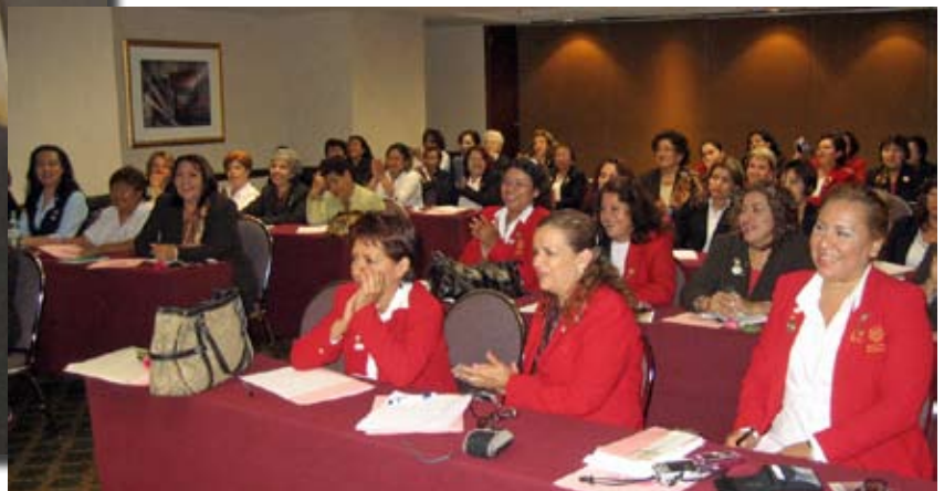
Giancristoforo Area Directors and Consultants at our training class.